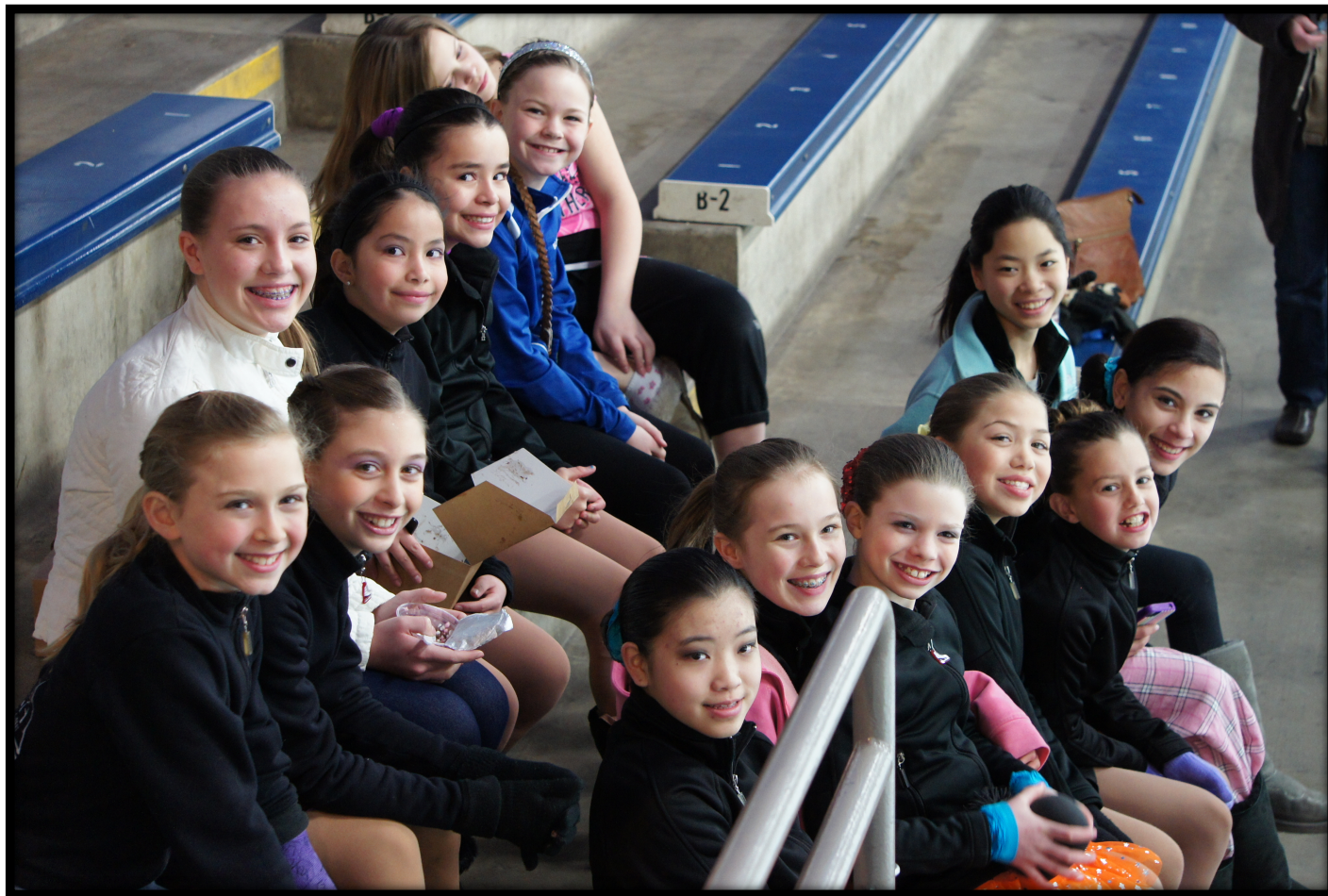
Smiles were all around as this group of skaters were watching the Blades of March Interpretive events.