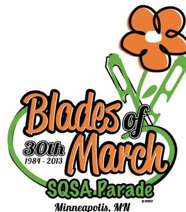
30 th Anniversary Logo 1984 - 2013

Blades of March is the longest continuously running ISI competition in District 10 and 2013 will be our 30 th year. We're planning to make this a special one and mark it with commemorative pins featuring the anniversary logo shown to the right.