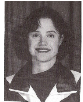
As a coach with Parade in 1995