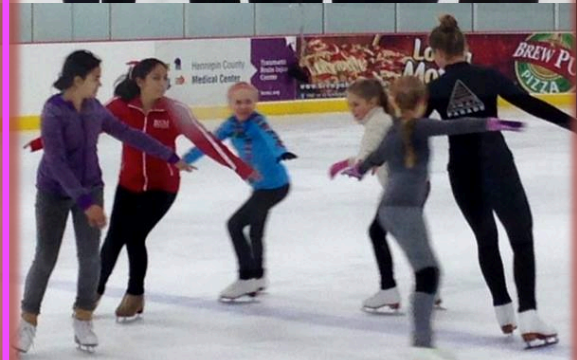
Our "Skating Mentors" groups working hard choreographing their programs