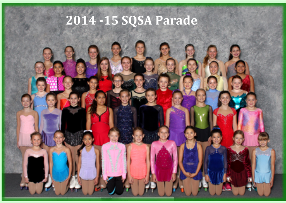
2014 -15 SQSA Parade