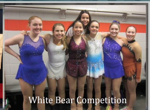
White Bear Competition