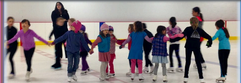
This season's Pixies skating team at practice